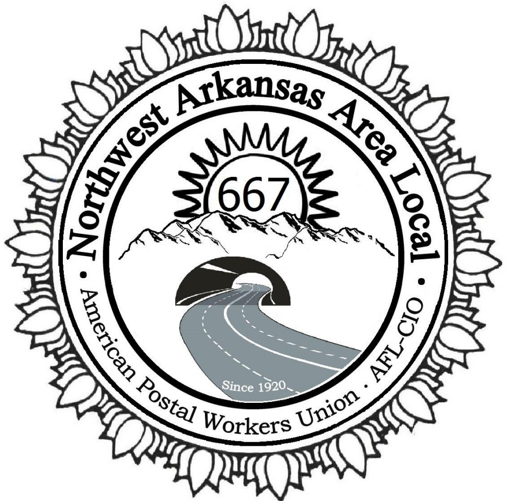
New Emblem for Northwest Arkansas Area Local (Voted on at January 10 th meeting)

Associate Offices: Fayetteville, Rogers, Springdale, Siloam Springs, Elkins, Huntsville, Lowell, Prairie Grove & West Fork